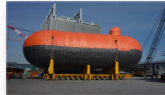
Semi-Pressurized Type 6.5K LPG Gas Carrier Tank