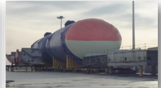
Semi-Pressurized Type 9K LPG Gas Carrier Tank