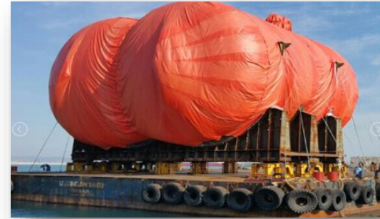
Semi-Pressurized Type 22K LPG Gas Carrier Tank

We have specialized in CARGO TANK on medium and small GAS transportation lines, such as LPG, Ethylene, and LNG.