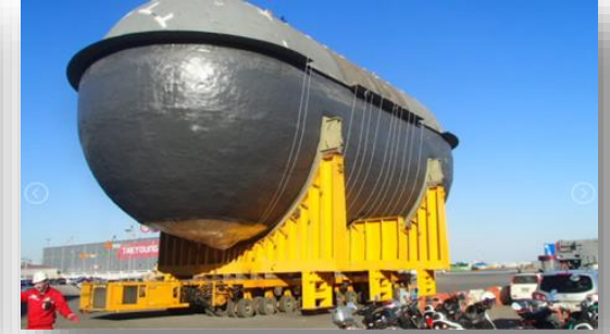
Fully-Pressurized Type 5K LPG Gas Carrier Tank