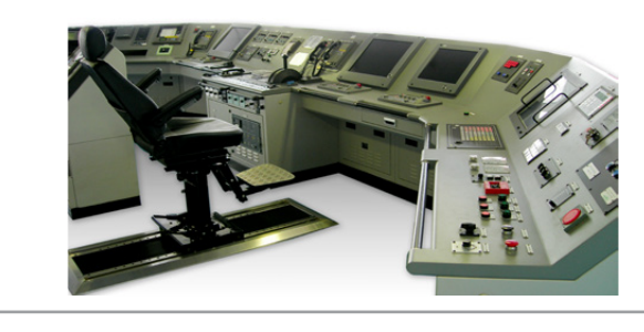
2. Navi. System Repair & renew